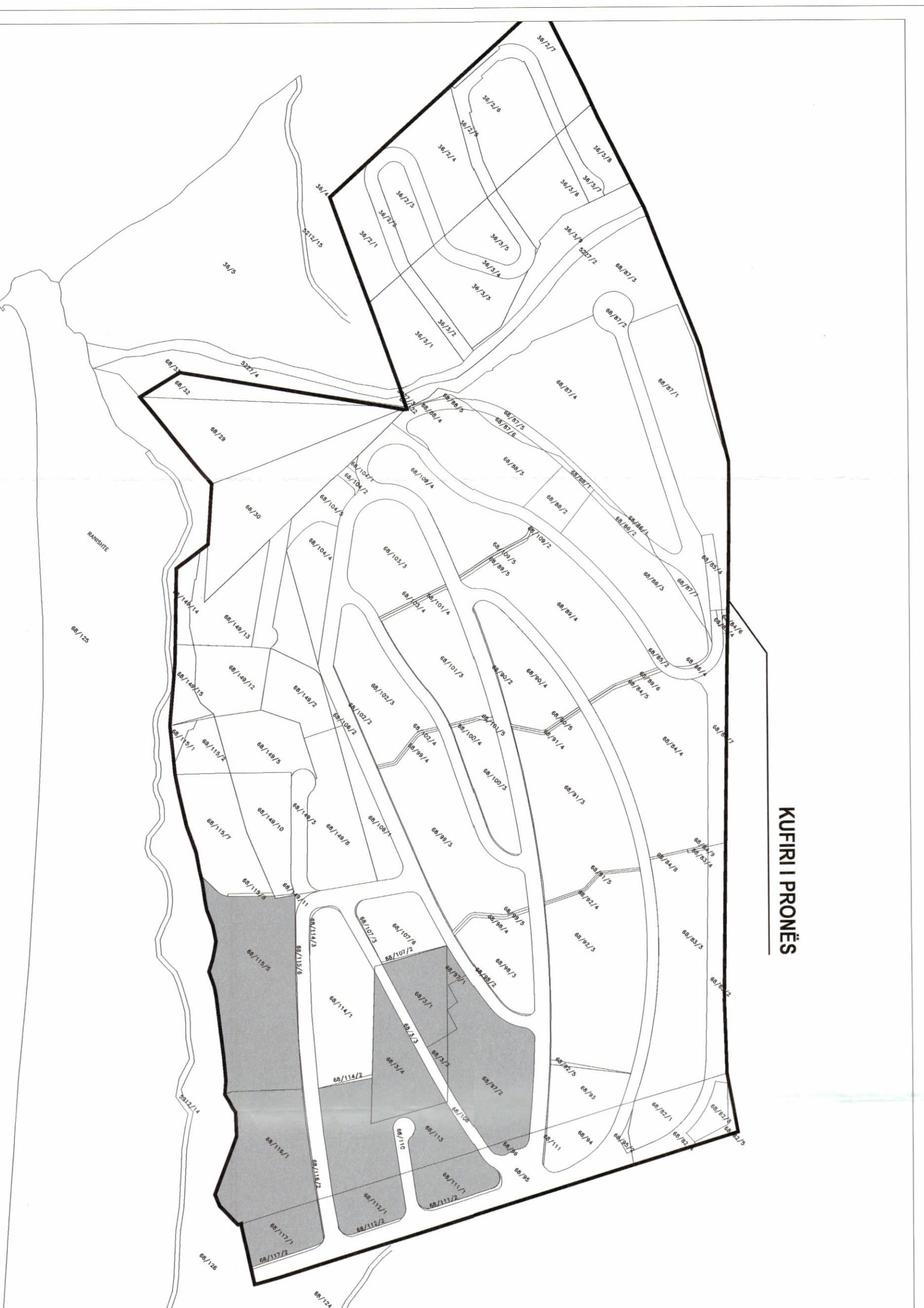
POZICIONI KADASTRAL SHK. 1:2500

PLANI I ZONIMIT DHE ZHVILLIMIT TË PARCELAVE