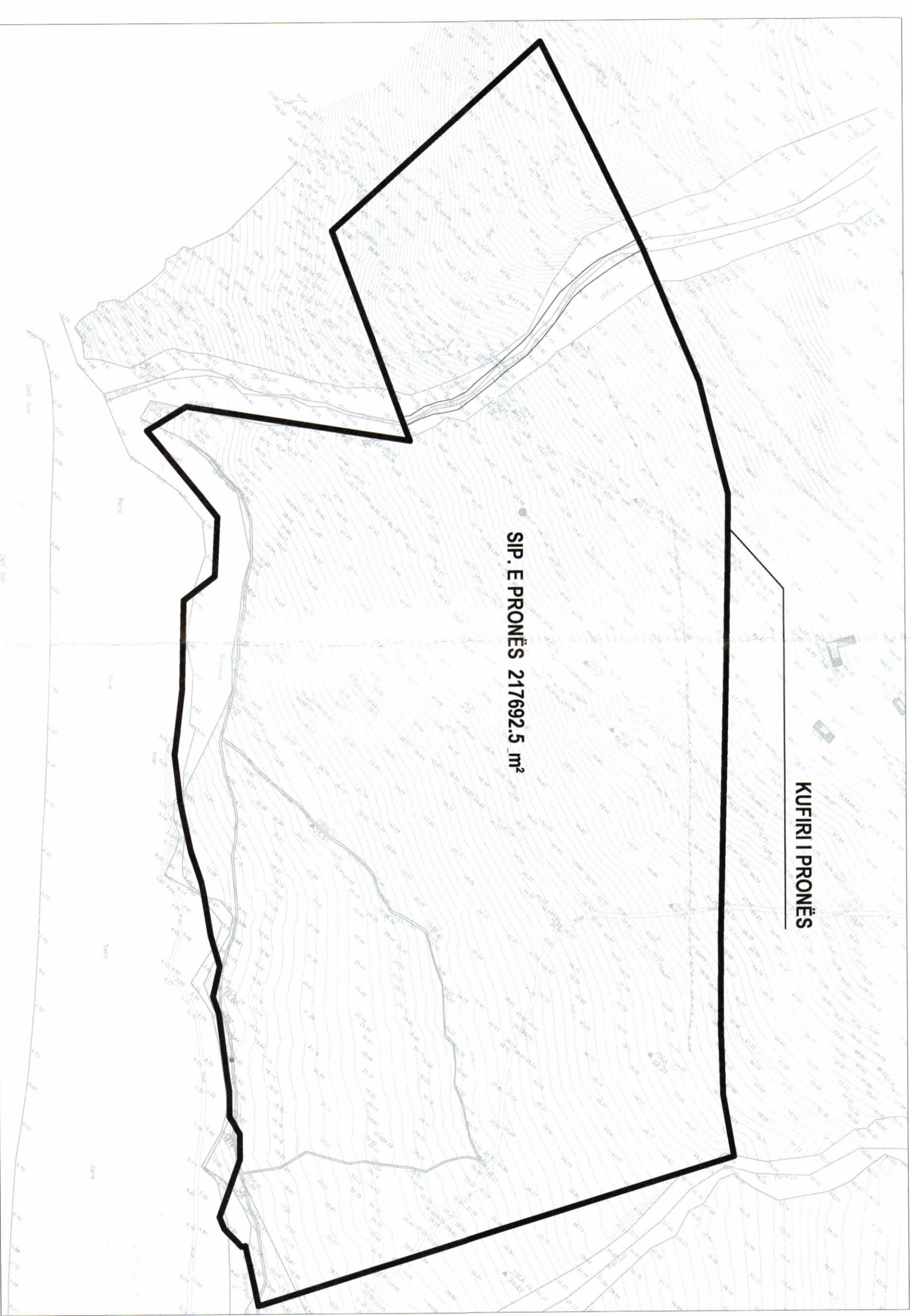
HARTA TOPOGRAFIKE SHK. 1:2500

TREKUESIT E ZHVILLIMIT: Sipërfaqe e përgjithshme e truallit: 217692.5 M 2 Sipërfaqe e truallit e zënë nga struktura (gjumja): 42010.14 M 2 Sipërfaqe e përgjithshme e ndërimit mbi tokë: 76872.52 M 2 Sipërfaqe e përgjithshme e ndërimit nën tokë: 2035.89 M 2 Sipërfaqe e përgjithshme e ndërimit: 78908.41 M 2 Koeficienti i shfrytëzimit të truallit për ndërtim: 19.3 % Koeficienti i shfrytëzimit të truallit për rrugë dhe hapësira publike: 22.4 % Intensiteti i ndërimit: 0.354 Lartësia maksimale e strukturës nga niveli i kuotës së sistemit: 12 M Resorti (vital): 3 K Numri i katëve mbi tokë: 3 K Numri i katëve nën tokë: 1 K